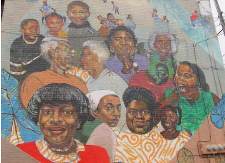
"Women of the North Side" mural, North Side Properties