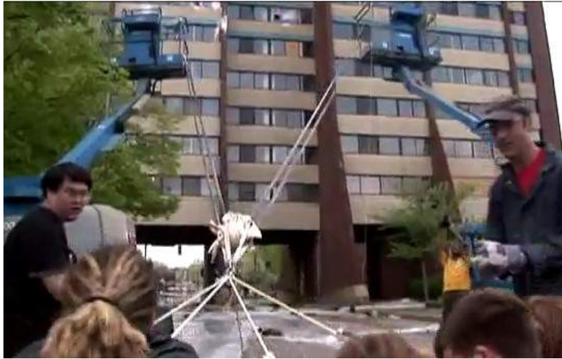
“Artists” lob paintballs at East Liberty residents’ former homes

Urban renewal in the 1960s created dense, mixed-income rental housing that became entirely low-income and HUD-subsidized after years of neglect. In the late 1990s, the neighborhood CDC (ELDI) developed a plan to replace the housing (Federal American Properties or FAP) with less dense mixed-income housing owned by a more responsible set of landlords. Hundreds of low-income people were uprooted and displaced. Of the 546 original households, only about 150 were able to remain in East Liberty and/or move to the new housing. Street vendors were chased from the commercial core. At least 14 locally-owned businesses were displaced or lost their clientele and were forced to close. National chains and high-end retail establishments were enticed to locate in East Liberty and hundreds of units of luxury housing are being built. The displacement of low-income tenants continues with the partial relocation of residents of another HUD-subsidized property (East Liberty Gardens or ELG) to an adjacent high-poverty area, the purchase of occupied rental properties for subsequent sale to high-end developers, and rapid increases in market rents.