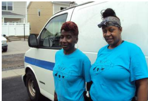
Premier Touch Cleaning Company

NCFH created a tenant-owned cleaning company to clean the common areas and turnover units at North Side Properties. The business is now expanding to other properties.