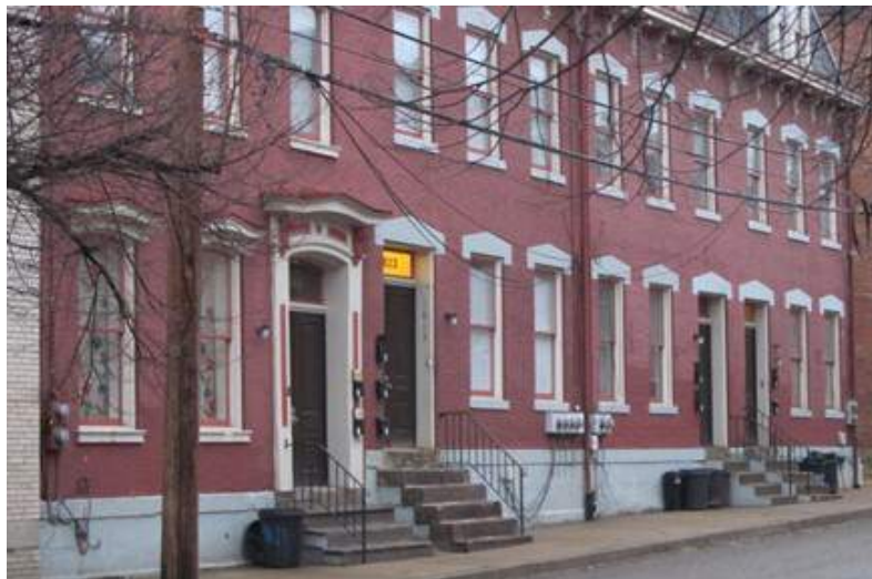
North Side Properties units, California-Kirkbride

NCFH's ownership interest gives the tenants of North Side Properties veto power over any sale of units or changes to affordability. That will ensure that the properties will remain affordable for years to come.