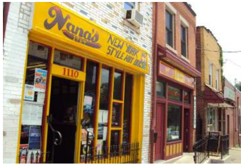
Preserved, new and long-time businesses on Federal Street

A Neighborhood CDC (ACCA) adopted a strategy to preserve/ attract locally-owned businesses in 2009. Since then, at least 4 such businesses have located in the main business district.