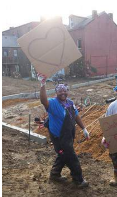
Playground build organized by the tenants of North Side Properties

Depending on the scope of work, rehabilitation and upgrades are done either while tenants remain in the unit, when a tenant moves out, or with a unit transfer within North Side Properties.